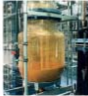
Precious metal chemicals