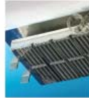
Precious metal devices and One-off products