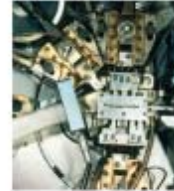
Contact-, precision stamp- and bent parts