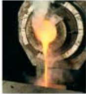
Precious metal refining