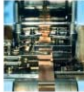
Precious metal semi-finished products