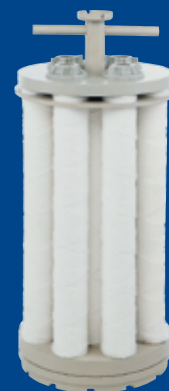
Cartridge filter assembly