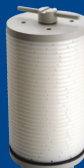
Disc filter assembly