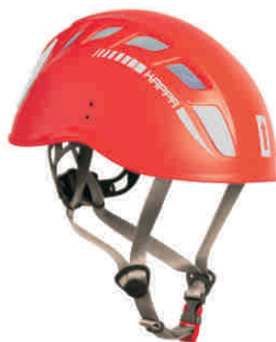
W9600RR00 KAPPA WORK red