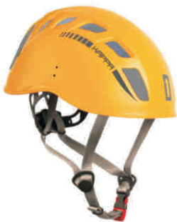
W9600YY00 KAPPA WORK yellow