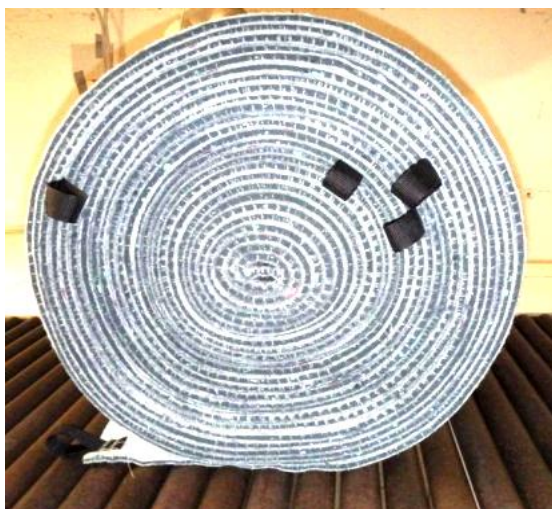
25 m oil protection belt instead of booms