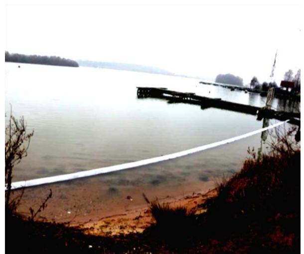
30 cm width oil protection belt absorbs and stops contamination at the same time