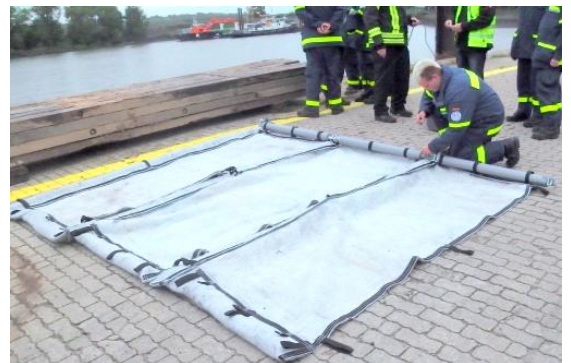
"little water mat" for port areas, shorelines 3 m oil absorbent mat with drag bar