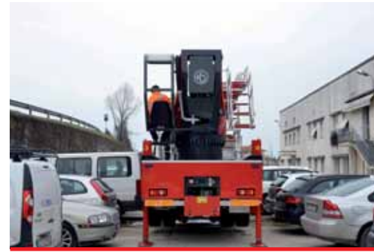
Narrow jacking working area