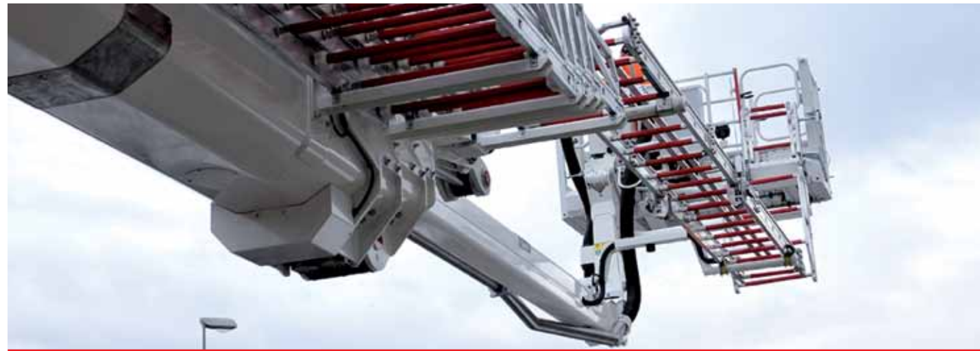
Second jib with independent movement