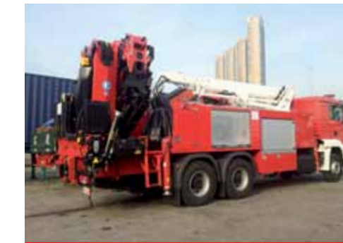
B-Tower + Effer crane