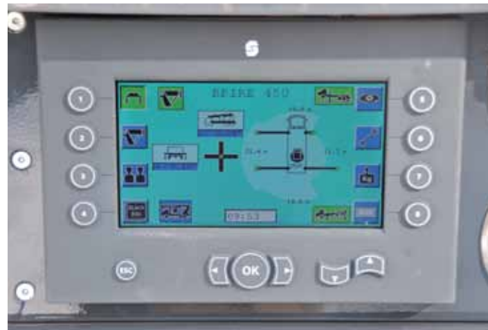
Stabilization operated by variable jacking system