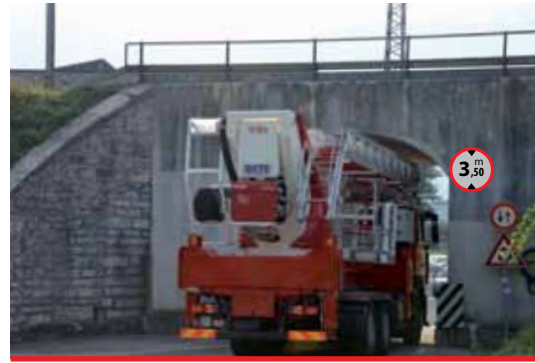
Compact dimensions in transport position