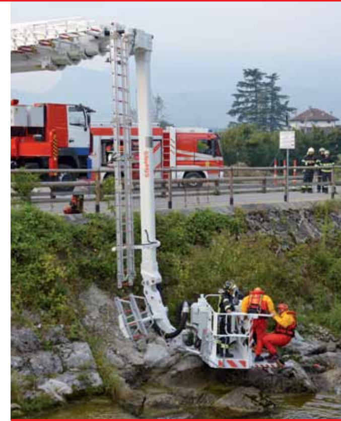
Rescue operation under the ground level