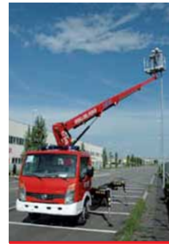
3,5 t fire truck