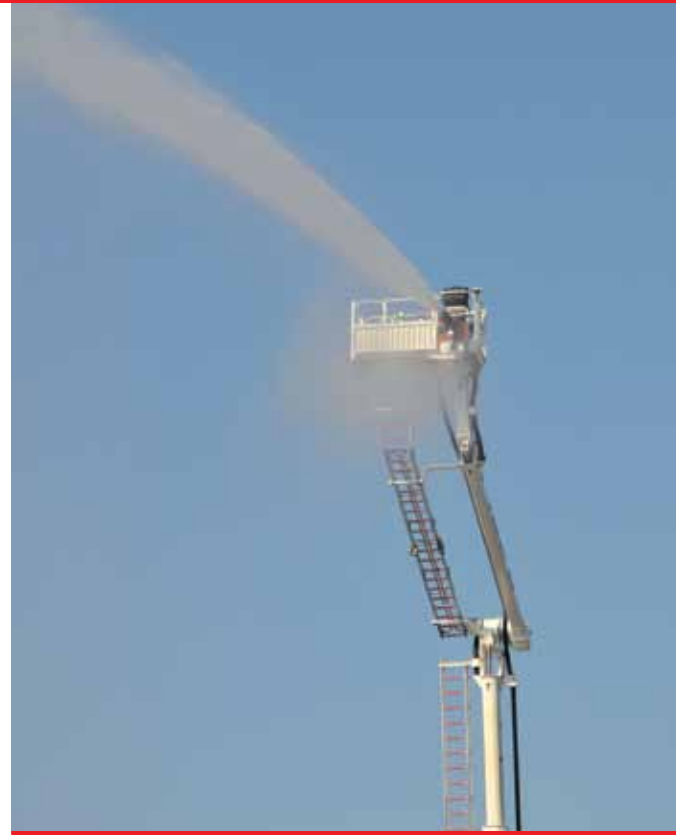
Water monitor capacity 4000 l/min