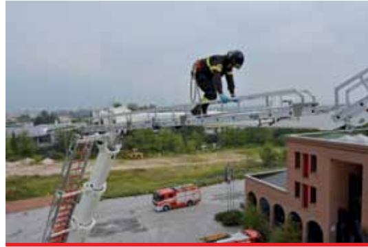
Rescue telescopic ladder on booms' side