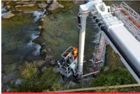
Negative working area

B-Fire range has been created for fire fighting and rescue operations. It's available with or without rescue ladder and with different options to satisfy all fire fighting market requirements.