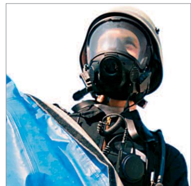
Quick and easy mask change thanks to click-lock system