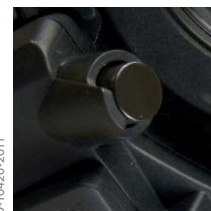
Dräger FPS-COM-PLUS ON/OFF switch