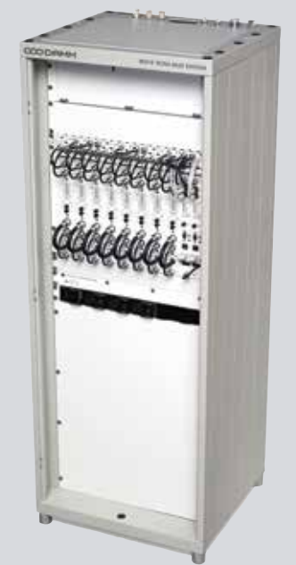
Indoor Base Station