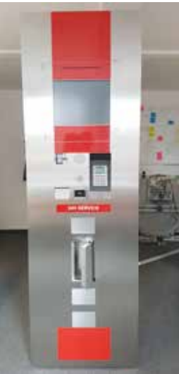
drum storage machine: front