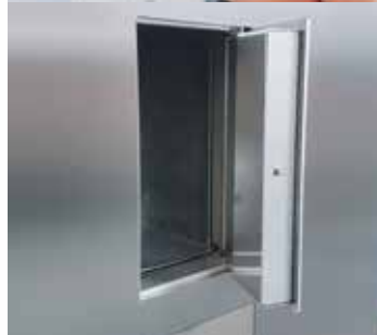
drum storage machine: door