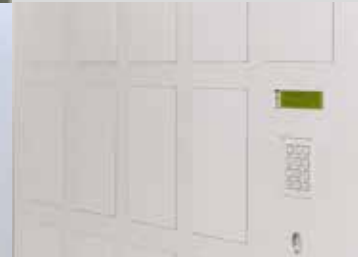
flap storage machine