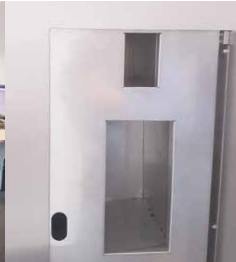
fill in section