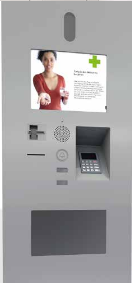
robot attached public output terminal

50 cms x 60 cms x 100 cms up to 200 cms x 200 cms x 200 cms (WxDxH)