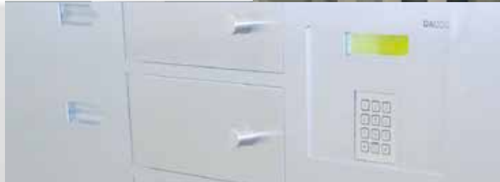
compartment boxes drum storage