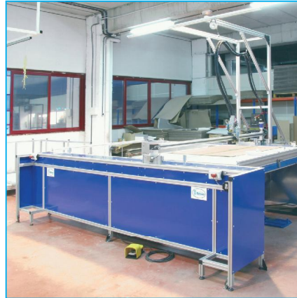
Bickers-JMP GLUEJET® XY-Glueing Table with integrated elevating platform: Option PA2