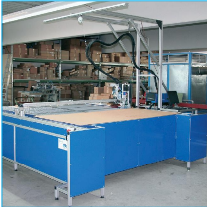
Bickers-JMP GLUEJET® XY-Glueing Table standard with 4 independent work stations