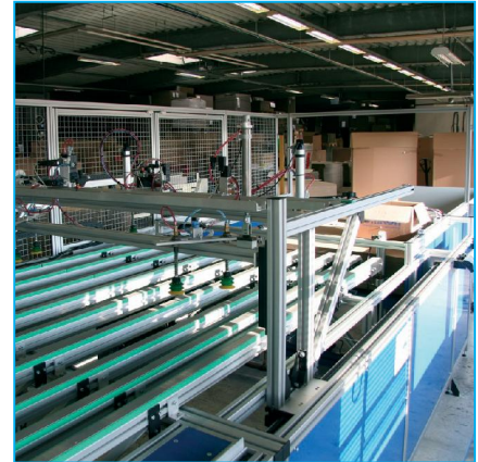
Bickers-JMP GLUEJET® XY-Glueing Table with conveyor and automatic feeder: Option CI

GLUEJET® Glueing Tables of Bickers-JMP are the solution for your glueing problems. By their versatile scope of application and easy operation these glueing tables allow an extreme reduction of costs per unit as well as strong improvements in productivity and in product quality. An effective use of your personnel resources and better conditions