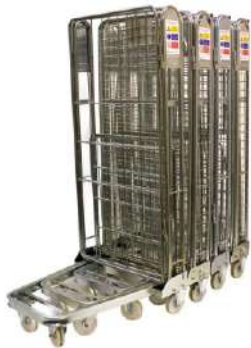
Foldable Roll Cage