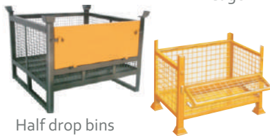
Half drop bins