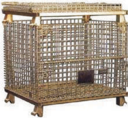
Wire Mesh Containers