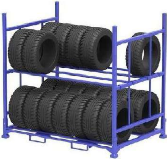
Removable Post Steel Pallet