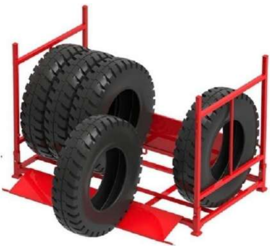
Truck Tyre Storage Rack