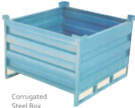
Corrugated Steel Box