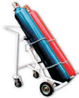
Double Cylinder trolley