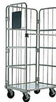
Nestable Roll Cage