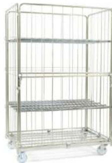
Demountable Roll Cage