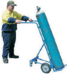
Single Cylinder trolley