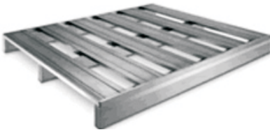
Single Deck Pallet